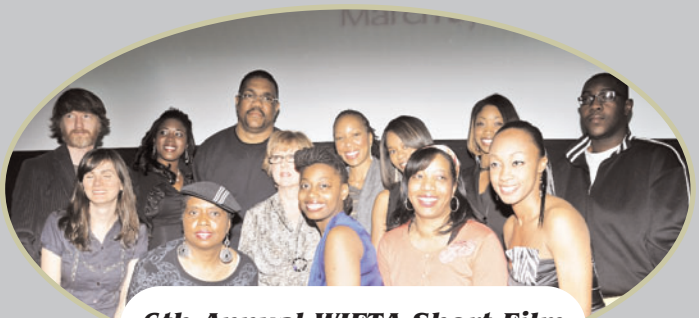
6th Annual WIFTA Short Film Festival Filmmakers