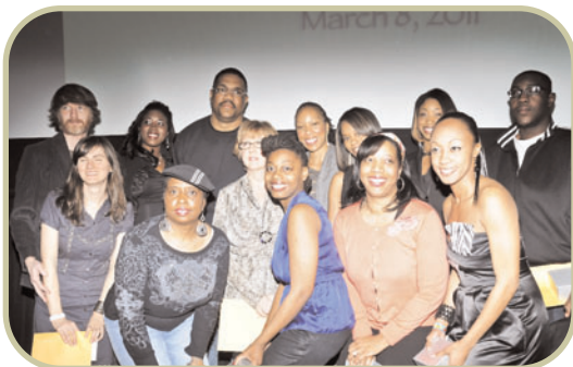
The filmmakers showcased at the 2011 WIFTA / WIFTI Short Film Festival pose for a group picture.

They laughed. Some jumped in surprise. Others' eyes welled up with tears. However, everyone undoubtedly walked away with a newfound or rejuvenated consciousness about social issues pecking at their minds. That, in a nutshell, was the collective experience of attendees of the 6th Annual WIFTA / WIFTI Short Film Festival. WIFTA, which was one of nine Women In Film & Television chapters hosting a film festival, showcased nine films: